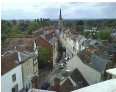
View of East St. Helen Street

Costs are £ 10.50 to include the guide and a soup & sandwich lunch. Further details are available at the March, and April meetings, but please register early for the visit to book the guide and various locations. Alternatively call Cynthia Robinson on 01491 572445.