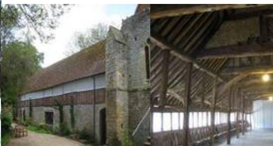
Abbey Lodging Range, exterior and interior