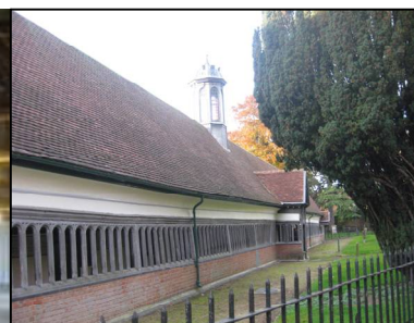
Long Alley Almshouses